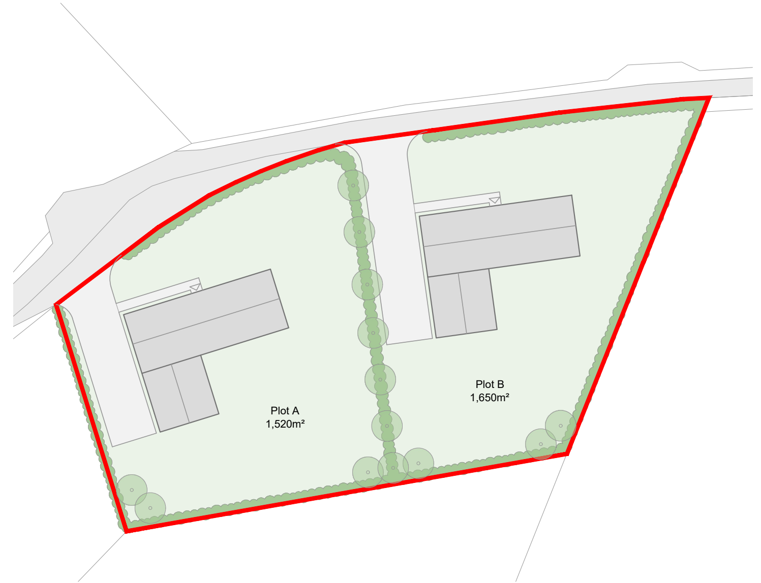
SITE PLAN - AS PROPOSED 1:500