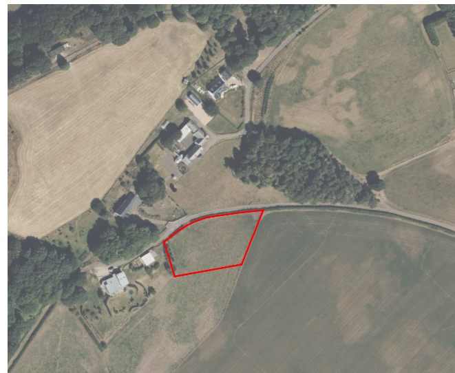
CONTEXT (Satellite image) - AS EXISTING NTS